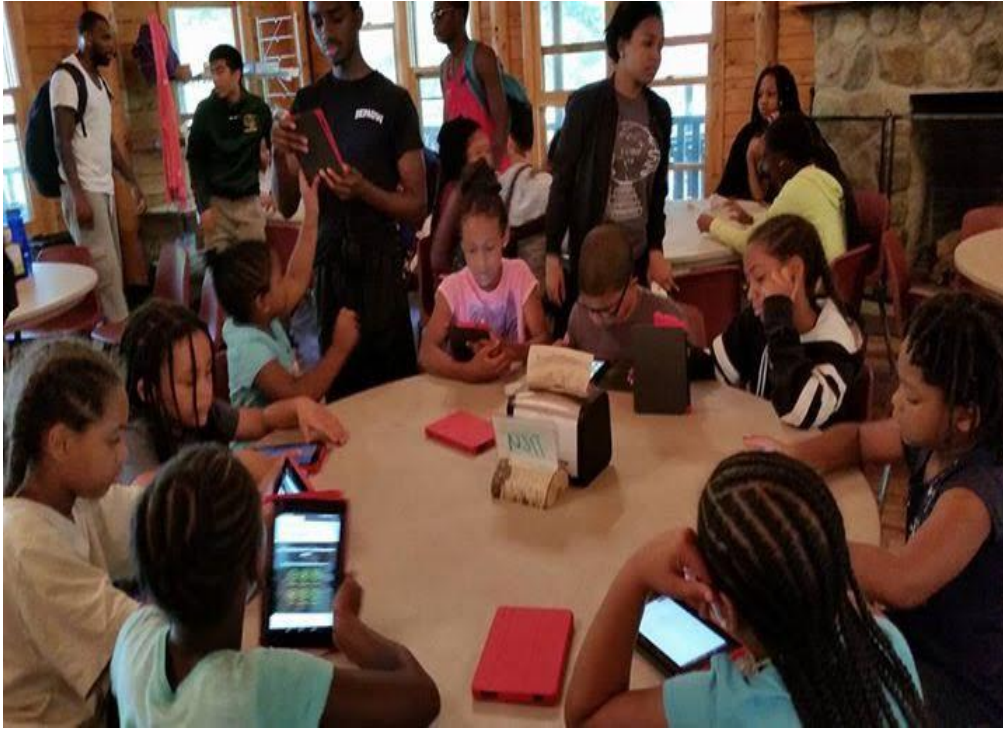
PFT YOUTH PARTICPATE AT THE PRINCETON BLAIRSTOWN CENTER STEM SUMMER CAMP

Fun & Learn Time “We had so much fun...we didn’t want to leave”