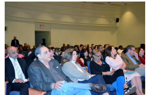
Spring into the Spirit Celebration at the New Jersey State Museum